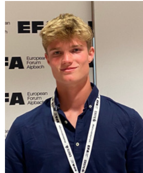
Alfred Williamson Scholarships